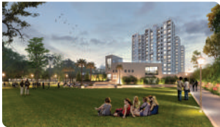
CLUBHOUSE & PARTY LAWN

From a wide outdoor garden, swimming pool, sports stadium to play area, fitness centre and other amenities, the Clubhouse, Office, Retail & Restaurant will certainly be a great enjoyment within the township.