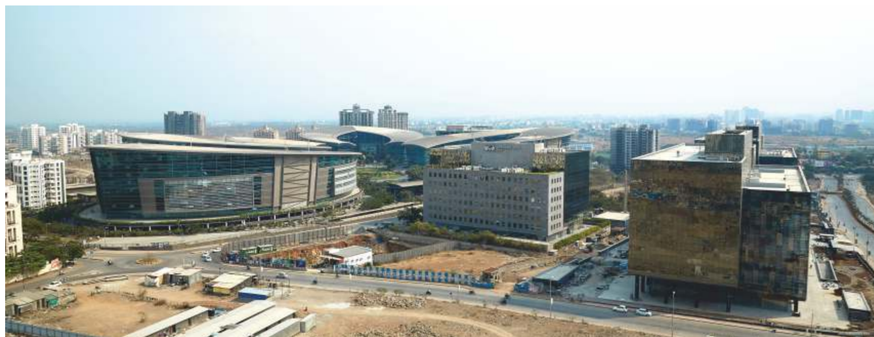
View from Ganga Platino apartment

We have picked the best to create your dream home